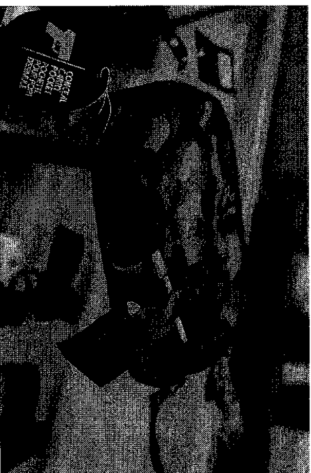
South Dakota Arms' Cerakote artist painted this handgun to match the conceal carry pocket.

"We are continuously evaluating the market to add relevant products," he said.